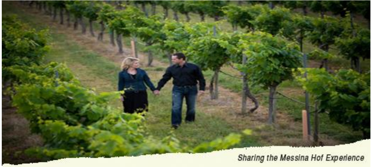
Sharing the Messina Hof Experience