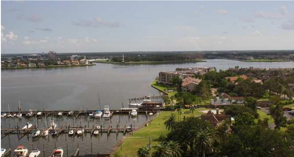
A beautiful view from every room

Combining a unique waterfront location with close proximity to some of the Houston area's most popular attractions, the Hilton Houston NASA Clear Lake hotel is a great place to stay if you want to make the most of your time. Visit the Space Museum at the NASA Space Center located only yards from the hotel. Head to the USS Texas museum and step aboard a genuine World War II battleship. Make the 10-minute trip and stroll through Kemah Boardwalk, home to a range of restaurants, bars and the Boardwalk Bullet wooden rollercoaster. Try your hand at some water sports or take a boat trip. Alternatively, enjoy sun, sand, and sea at nearby Galveston Beach.